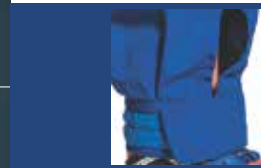
Adjustable ankle straps