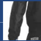
Reinforced elbow material