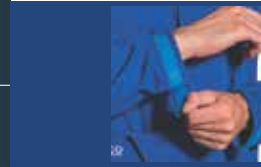
Adjustable wrist straps