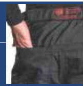
Large rear pockets