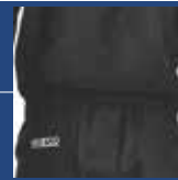
Elasticated back panel