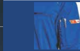
Front and side pocket